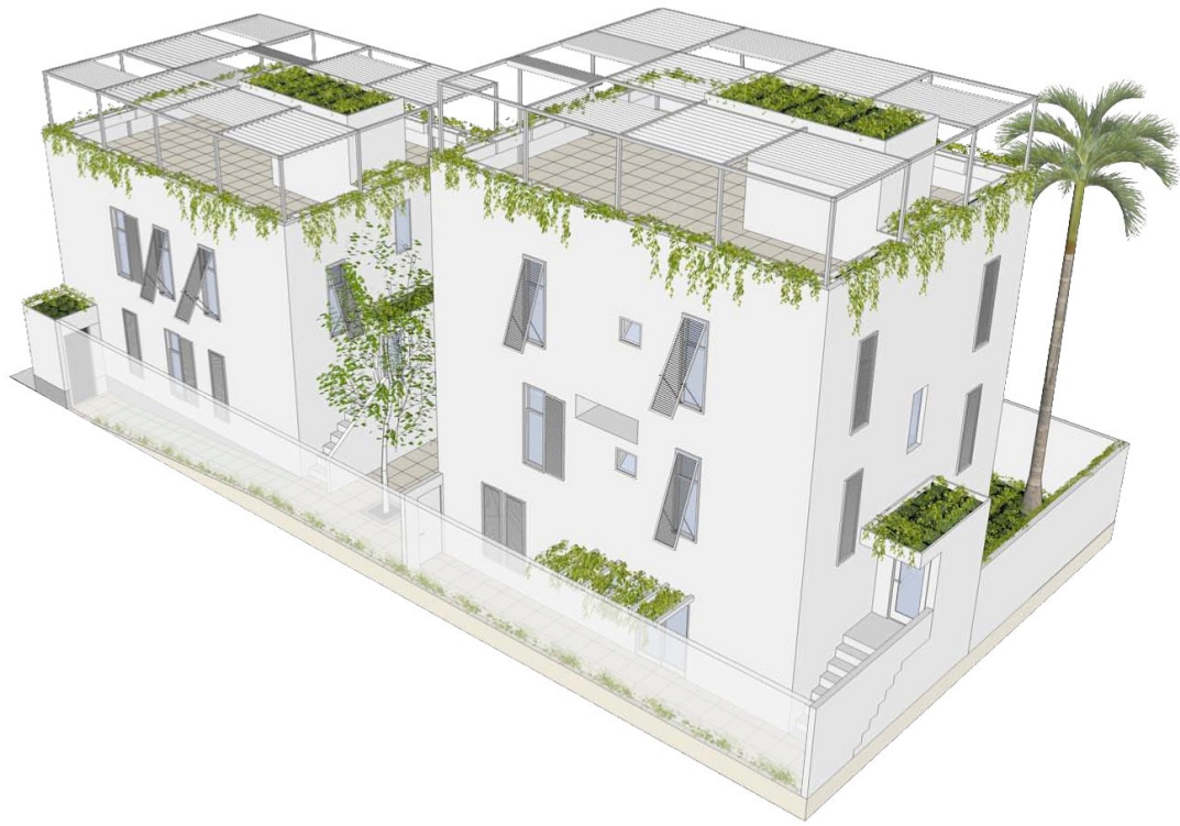
BIRDS EYE PERSPECTIVE